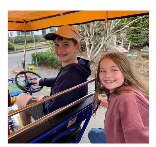
Thank you for supporting our ministry and family.

The zoom link is the same for every call: <a href="https://zoom.us/j/5039830360">https://zoom.us/j/5039830360</a> (password is honey )